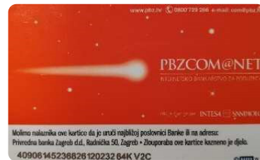
Figure 2. The back of the PBZ PKI card

In order to be able to use PBZ PKI cards (Figure 1, Figure 2), i.e. in order to access the PBZCOM@NET service via these cards, one-off installation of software will be required.