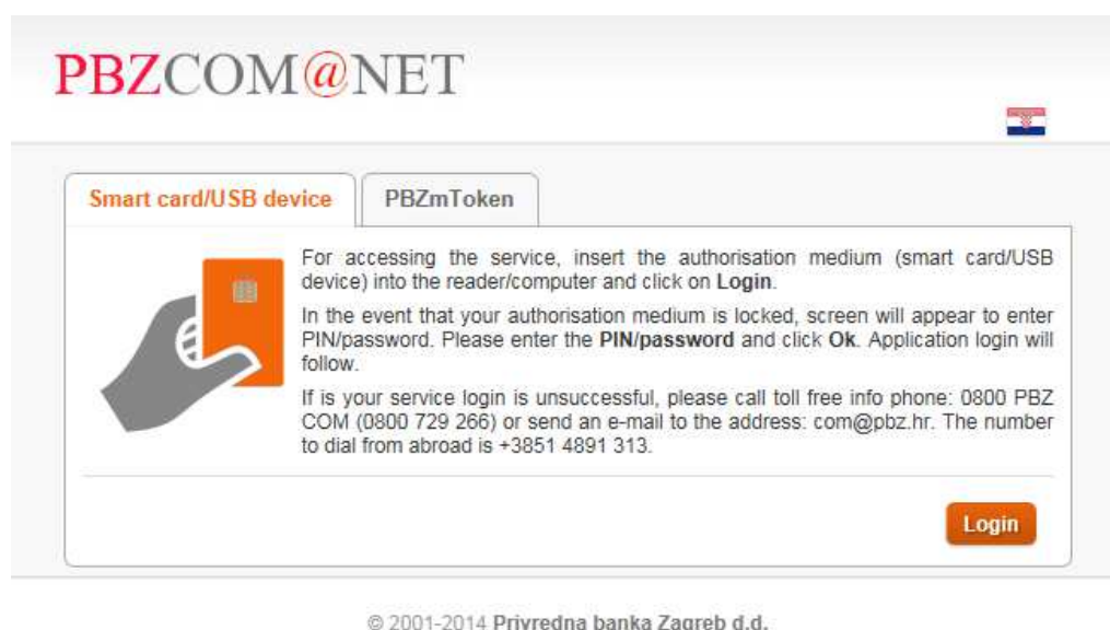
Figure 1 – Log in the PBZCOM@NET service with smart card/USB stick or PBZmToken

IMPORTANT NOTICE: if the Bank's address does not start with http://com.pbz.hr YOU HAVE NOT ACCESSED THE BANK'S WEB PAGES, and you are obliged to stop using the service immediately.