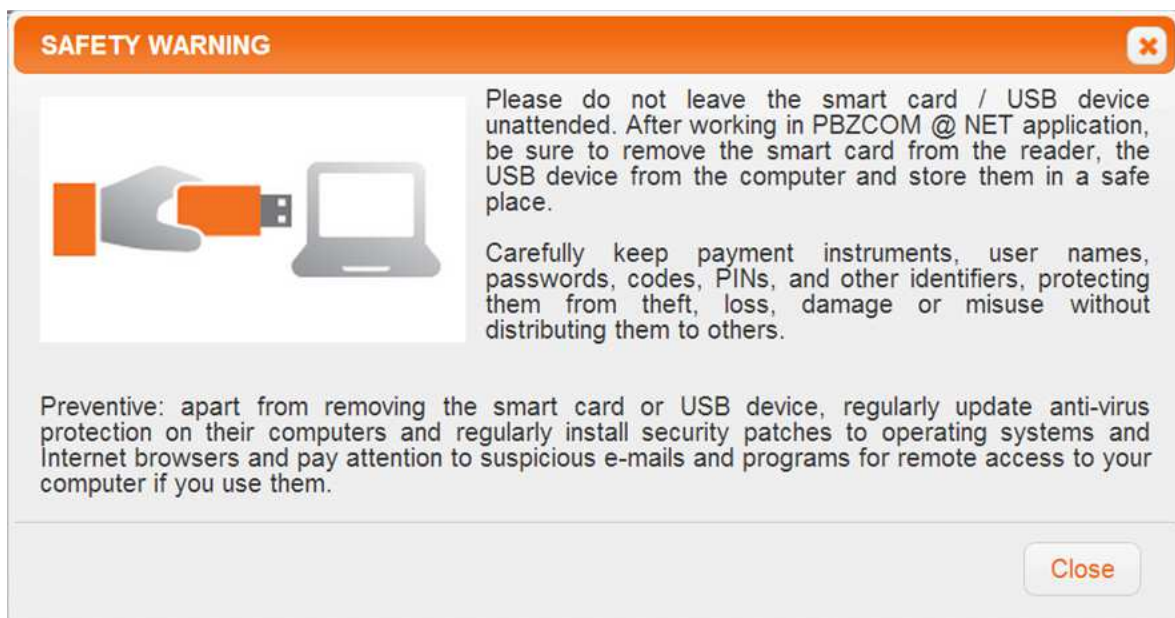
Figure 4 – Security warning in PBZCOM@NET service

Upon finishing the work in the service, please act according to instructions set out in the image (Figure 4)