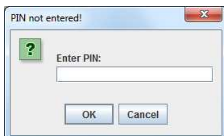
Figure 2 – Entry of password/PIN

IMPORTANT NOTICE: you have to change your PIN on your own if you know that an unauthorised person has found out, or you suspect so, your PIN.